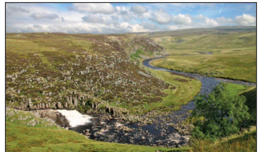
Cauldron Snout and the river Tees.